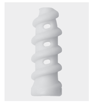
FastThread BioComposite Interference Screw

Ideal for tibial fixation of soft-tissue and patellar tendon grafts, FastThread interference screws can be inserted quickly, provide strength, and are designed to protect the graft.