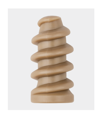
FastThread PEEK Interference Screw

The InternalBrace surgical technique is intended only to augment the primary repair/reconstruction by expanding the area of tissue approximation during the healing period and is not intended as a replacement for the native ligament. The InternalBrace technique is for use during soft tissue-to-bone fixation procedures and is not cleared for bone-to-bone fixation.